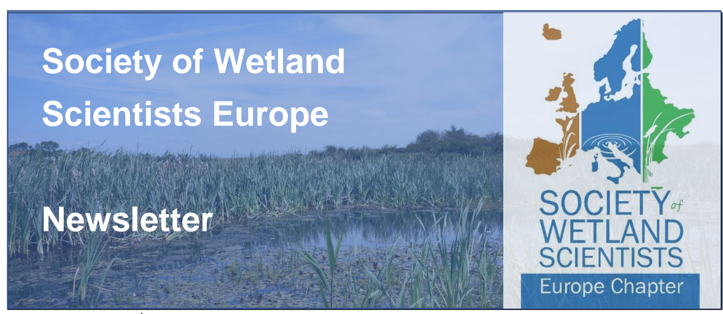
| Issue 1/2024 | 3<sup>rd</sup> May 2024 | Spring Newsletter |